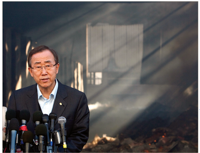
The Secretary-General holds a press conference in front of a damaged UN building in Gaza, 20 January.